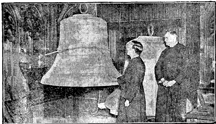
YORK MINSTER: Hoisting one of the Bells into the S.W. Tower