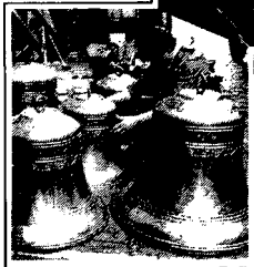
Master Craftsmen creating part of our heritage to delight future generations

How true our motto is! Every year our sound touches the lives of more people in more lands. Whether it is handbells, a clock chime, an English change-ringing peal, a carillon, or even a single bell, our experience and expertise ensures unequalled perfection and depth of tone. Naturally, the quality of the bells is mirrored in every aspect of our work - simply, the best!