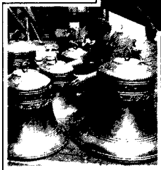
Master Craftsmen creating part of our heritage to delight future generations

How true our motto is! Every year our sound touches the lives of more people in more lands. Whether it is handbells, a clock chime, an English change-ringing peal, a carillon, or even a single bell, our experience and expertise ensures unequalled perfection and depth of tone. Naturally, the quality of the bells is mirrored in every aspect of our work - simply, the best!