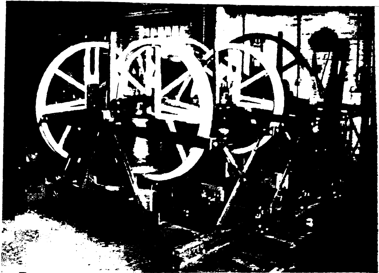
A NEW RING OF SIX DURING CONSTRUCTION IN OUR WORKS