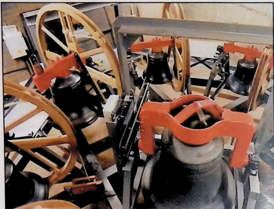
NEW PEAL OF EIGHT IN RADIAL FRAME TOGETHER WITH ELECTRICALLY SWUNG BOURDON AND STATIONARY SERVICE BELL, SOUTH OCKENDON.